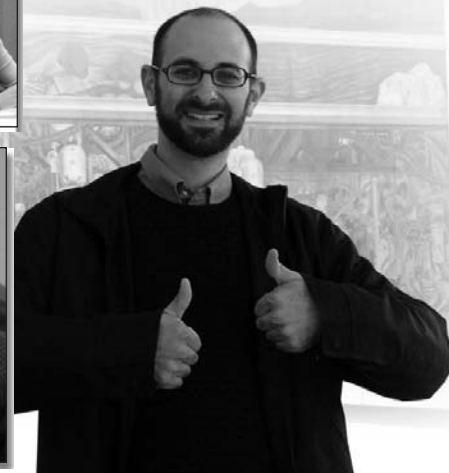
All Photos by MAM unless otherwise noted.