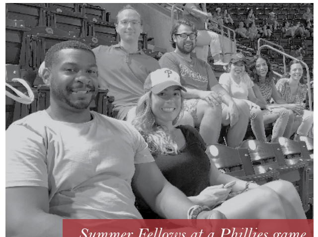
Summer Fellows at a Phillies game.

I worked on the summer-long petition drive of the labor movement in Missouri. Our state successfully beat back the newly-enacted Right to Work law by collecting 310,567 signatures. Being part of this historic victory and marching at the Capitol when we submitted the signatures, was definitely the highlight of my summer!