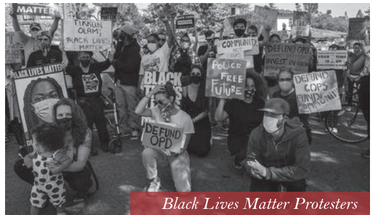
Black Lives Matter Protesters in Oakland, CA